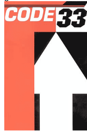
Image: Code 33 logo

I have recently written an ethical statement, drawn from sociology, anthropology and art practice. This will operate as a framework within which to conduct my research and art practice and allow participants to understand what they will get from participating and to be knowingly involved in and understand their contribution to projects. It will also help me to understand the nature of participant contribution to an art practice.