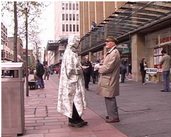
Image: Detail from Insufficiently Prepared Adventure: Escape to the Country 2004

This has arisen out of three related issues: I am engaged in doctoral research, which requires an explicit acknowledgement of an ethical implication; my work is about individual social change, which could imply some responsibility for support; and a personal discomfort in making and documenting site specific art work, which occasionally felt like engagement under false pretences or deception.